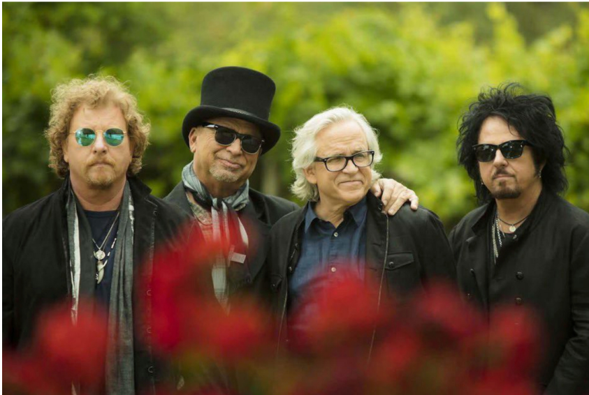
Toto, whose hit song, "Africa," is now playing for all eternity in the Namib desert.

Most definitely my Toto "Africa" karaoke singing skills. I'm a creative partner of the international creative studio KesselsKramer so there are always a lot of projects going on. In my spare time, I'm currently working on a variety of new photo series, music videos and new book and magazine publications. I like to stay busy and have fun with my work.