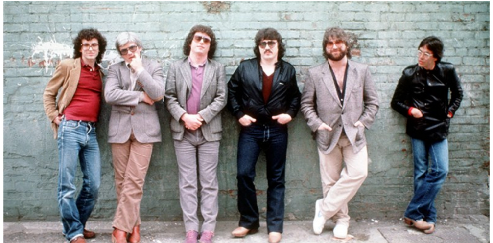
Toto in 1982

Six speakers and solar energy might make Max Siedentopf's "Toto Forever" go on forever